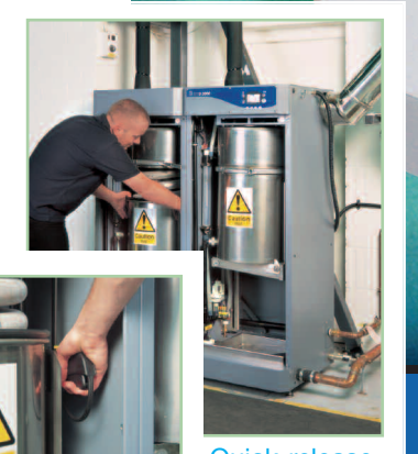
Quick-release tank mechanism

Quick-release tank mechanism allowing limescale build-up to be emptied in less than five minutes from start to finish. The same maintenance on other gas-fired humidifiers can take up to four hours. For a demonstration of how easy this is, visit our website at www.jshumidifiers.com.