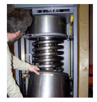
Release band clamp