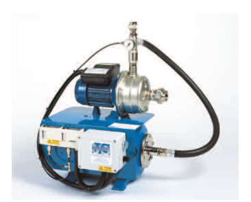
JS Pureflo water pressurising pump