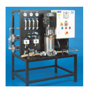
JS Pureflo reverse osmosis unit